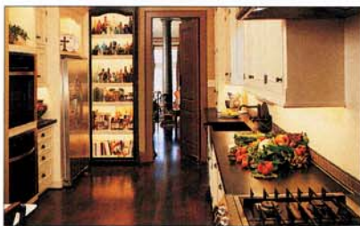
IDEA HOUSE KITCHEN