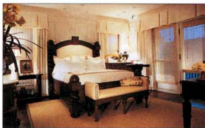
IDEA HOUSE BEDROOM

All proceeds from the premier benefited the Houston Ballet.